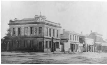
Beechworth Wine Centre 1860's