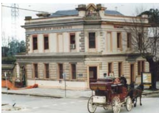
Beechworth Wine Centre 1980's