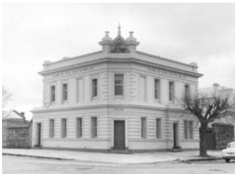
Beechworth Wine Centre 1950's

Vintage Direct have taken on the fantastic Prahova Valley Reds at only $186.00 a dozen.